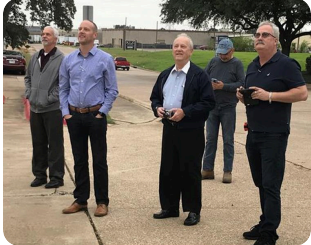
An "elevated" mock-up