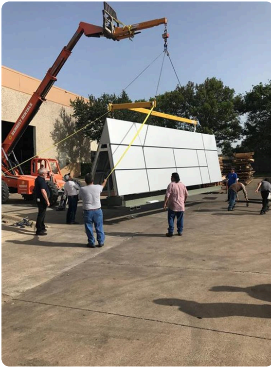
MoMA Tower - Apex 2 Test Pick