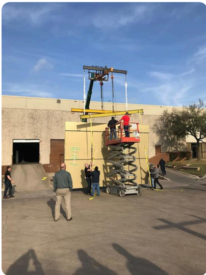
Apex 3 Test Pick