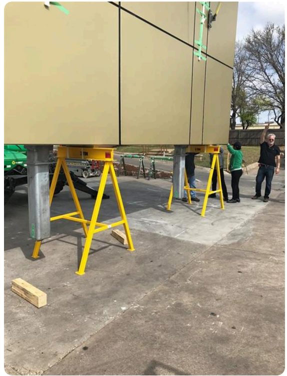
MoMA - Apex 3