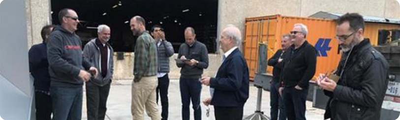
A lighter moment