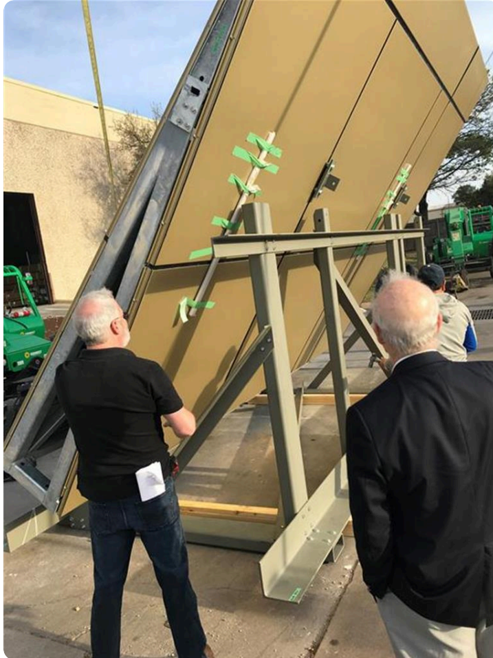
MoMA Tower - Apex 3 in Dallas